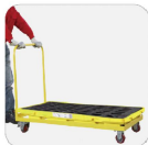
2-drum spill pallets with stackable structure save space and transportation cost