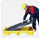
Spill pallets with stackable structure save space and transportation costs