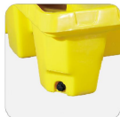
Hexagonal drain plug facilitates drainage