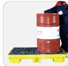
Poly spill pallet ramps make it easier to move large particles