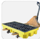
Hydraulic carrying vehicles can also be used to move pallets, which is more convenient