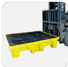
Spill pallets have forklift slots for convenient forklift operation to improve efficiency